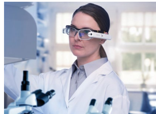
Mobile access to data with voice control

The M3000 delivers an updated ergonomic design with enhanced waveguide optics, functionality and wearability.