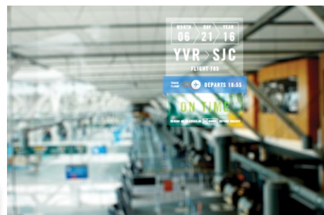
Travel information and alerts