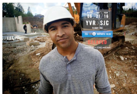
Alerts from the job site