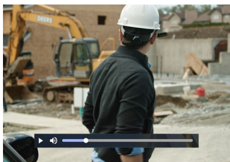
Record videos while on-the-go