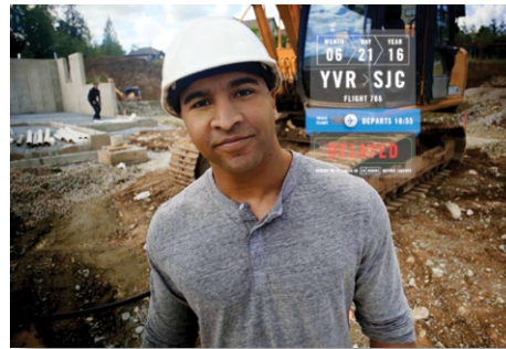
Alerts from the job site