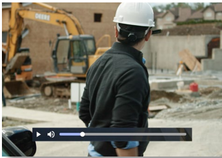
Record videos while on-the-go