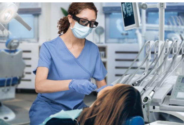
Immediate mobile access to patient data and tests

location-aware information, data collection and more. The private, see thru, full color, bright, high resolution big screen performs both indoors or in sunlight. The Vuzix Blade 3000 – your wearable mobile personal computer for your workplace applications.