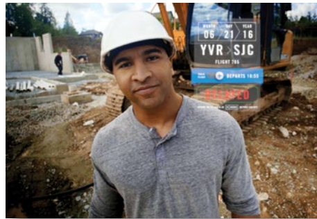
Alerts from the job site