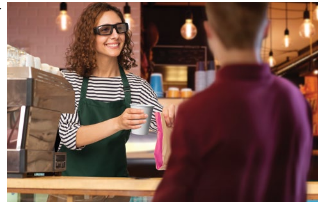
Enhancing service in retail through mobile hands-free access

The Vuzix Blade 3000 Smart Sunglasses are completely untethered, and support both wireless Wi-Fi and Bluetooth interfaces. They deliver a “hands free” digital world, providing unprecedented access to