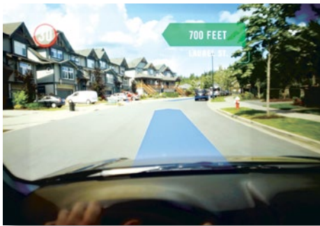
Access to HUD for Navigation