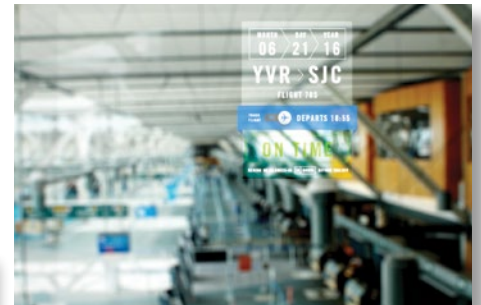
Travel information and alerts